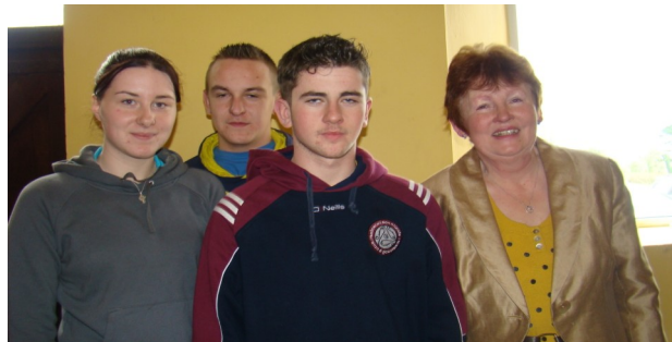
Cuid de na hiarscoláirí a bhí ag Bean Uí Bhroin a tháinig chun slán a fhágáil léi. Some of Bean Uí Bhroin's past pupils who came to say goodbye.