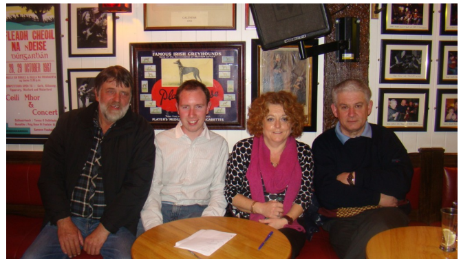
An bord a tháinig sa dara háit i dtráth na gceist. The table that came in second place in the table quiz.