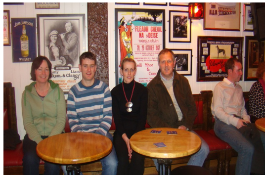
An bord a tháinig sa triú háit ar an oíche. The table that came third on the night.